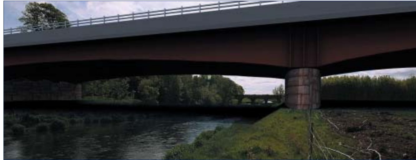
Artistic impression of Structure 19

One of the largest structures on the project commenced in December 2008. Structure 19, the crossing of the River Boyne at Ballinteer, is a 3 span composite structure. Works are currently concentrated on the foundations with the steelwork being fabricated off site. The delivery and erection of the main structural beams is planned for the summer 2009, this will see the structure take shape.