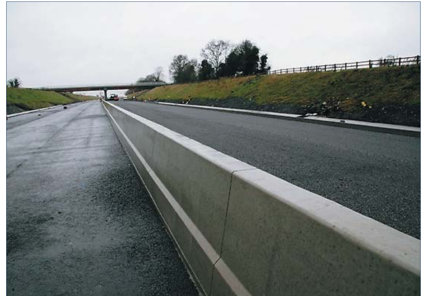
Section of M3 Motorway constructed up to within 45mm of the surface layer.

Testing and inspection records are thoroughly analysed through internal and external audits carried out by Eurolink (the concessionaire company) and Meath Consult (Site Representatives of the National Roads Authority).